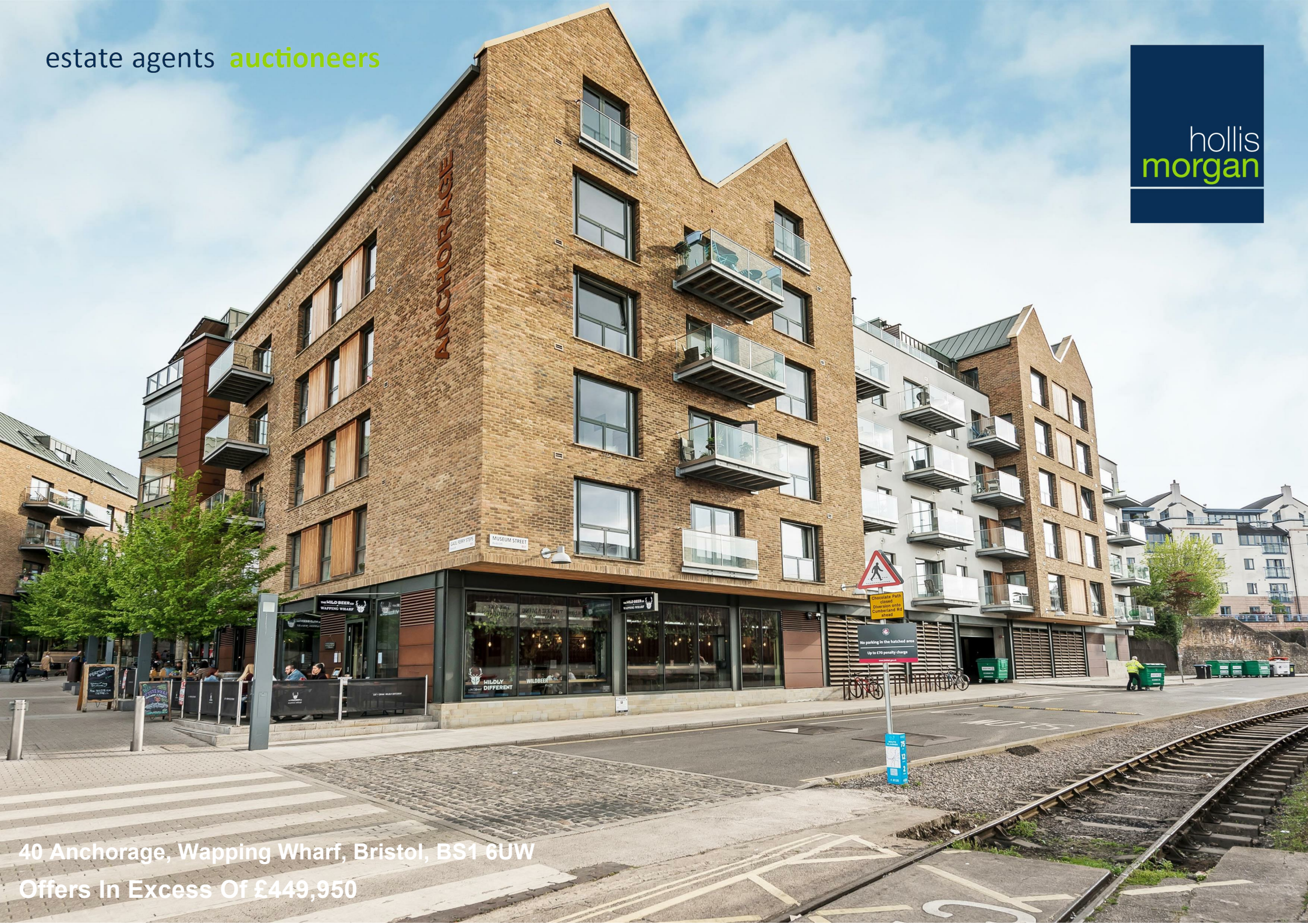
40 Anchorage, Wapping Wharf, Bristol, BS1 6UW Offers In Excess Of £449,950